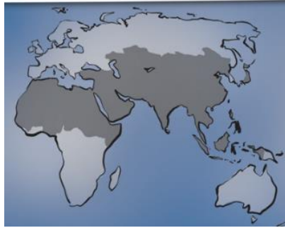
The 10/40 Window

Some pictures and missionaries in this section don't correspond perfectly to the dates because of lack of space