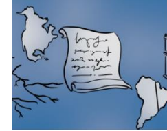
The Treaty of Tordesillas