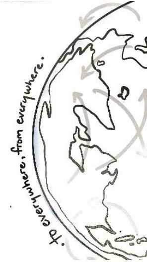
From Everywhere To Everywhere