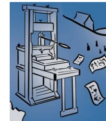
The Printing Press, The Reformation, and Missions